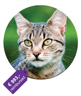
Tiger European shorthair

Our Tiger just kept on eating and losing weight. After blood tests, we discovered that her thyroid did not function properly.